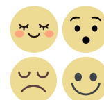
Proactive emotional education