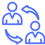
Training for schools and health and social care