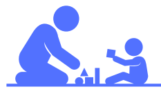
121 support for children