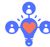
Parent empowerment workshops and private sessions