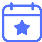
Community events and support